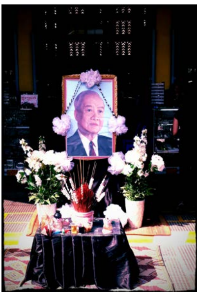
Sihanouk's funeral

Past-life memory in Cambodia is common. In Buddhist scriptural practices, past-life memory is usually thought of in terms of the Buddhist cycle of samsāra , where past-life memory is often a prerequisite for advanced stages of spiritual accomplishment. However, in practice, past-life memory is often deeply disturbing to the rememberer, their family and their community.